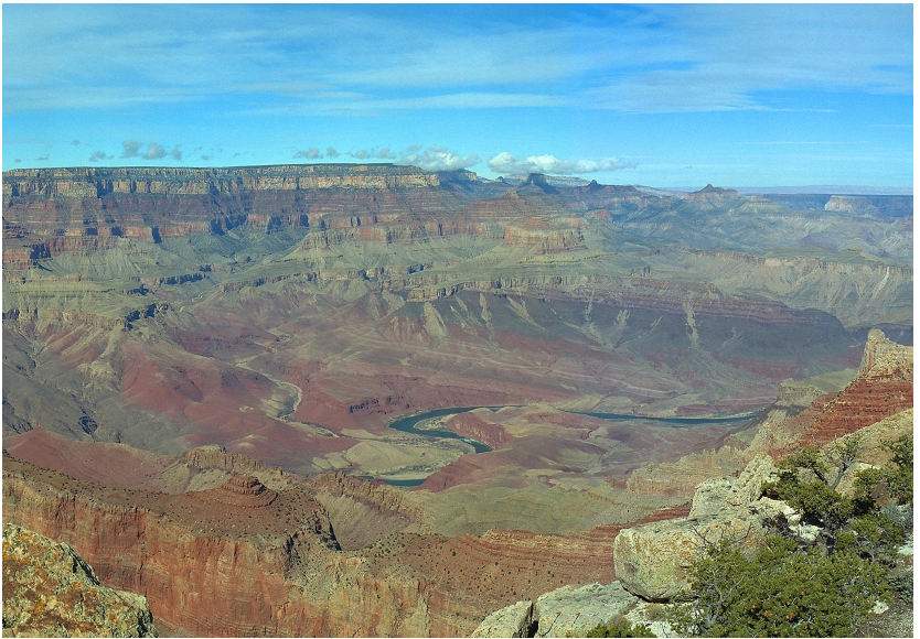
The Grand Canyon and the Colorado River from Lipan Point